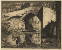
Title: The Bridge, Barnard Castle Primary Maker: Frank Brangwyn Medium: Etching