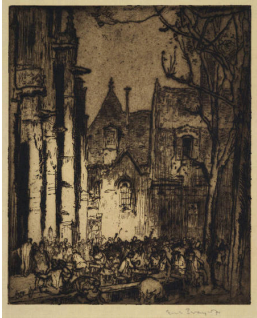
Title: Notre Dame La Riche, Tours Primary Maker: Frank Brangwyn Medium: Etching, drypoint, and plate tone on ivory wove paper