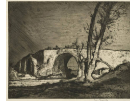
Title: The Bridge at Alcántara Date: 1920 Primary Maker: Frank Brangwyn Medium: Etching on wove paper