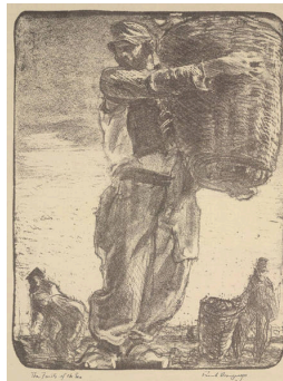
Title: Fruits of the Sea Date: ca. 1908 Primary Maker: Frank Brangwyn Medium: Lithograph on wove paper