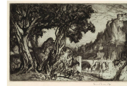
Title: Romantic Landscape Date: 1925 Primary Maker: Frank Brangwyn Medium: Etching