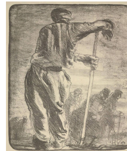
Title: The Labourer Resting Date: 1908 Primary Maker: Frank Brangwyn Medium: Lithograph on wove paper