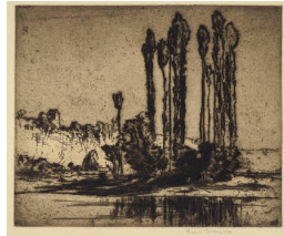
Title: The River Lot (landscape with poplars) Date: 1910 Primary Maker: Frank Brangwyn Medium: Drypoint and etching printed from zinc plate