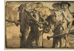
Title: Musketeers Date: 1907 Primary Maker: Frank Brangwyn Medium: Color lithograph on wove paper