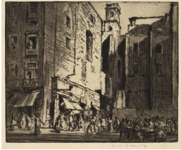
Title: Backstreet at Naples Date: 1912 Primary Maker: Frank Brangwyn Medium: Etching on lime paper