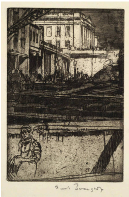
Title: Fishmongers Hall, London Date: 1904 Primary Maker: Frank Brangwyn Medium: Etching