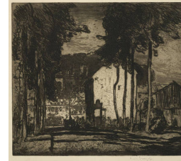
Title: Entrance to Montreuil Primary Maker: Frank Brangwyn Medium: Etching and drypoint on wove paper