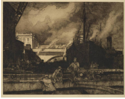
Title: London Bridge No. 2 Primary Maker: Frank Brangwyn Medium: Etching on wove paper