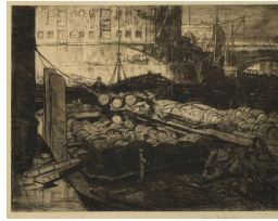
Title: London Bridge No. 3 Primary Maker: Frank Brangwyn Medium: Etching