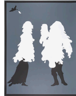
Title: Scene 15 from the series Emancipation Approximation (white piles) Date: 1999-2000 Primary Maker: Kara Walker Medium: Silkscreen Edition 15/25