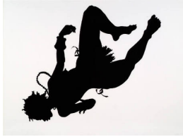
Title: African/American Date: 1998 Primary Maker: Kara Walker Medium: Linocut