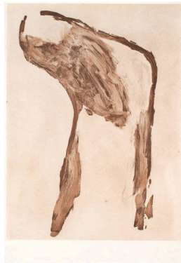
Title: Untitled Date: 1984 Primary Maker: William Tucker Medium: Etching and aquatint on wove paper Edition 27/85