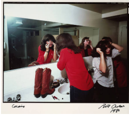
Title: Cocaine, from the portfolio Los Angeles Documentary Project Date: 1980 Primary Maker: Bill Owens Medium: Silver dye bleach print