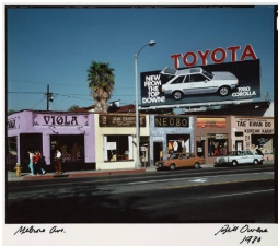
Title: Melrose Ave., from the portfolio Los Angeles Documentary Project Date: 1980 Primary Maker: Bill Owens Medium: Silver dye bleach print