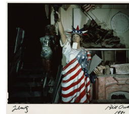
Title: Liberty, from the portfolio Los Angeles Documentary Project Date: 1980 Medium: Silver dye bleach print