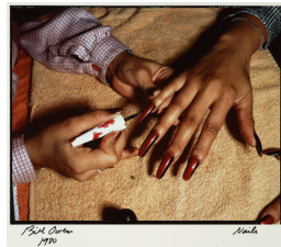
Title: Nails, from the portfolio Los Angeles Documentary Project Date: 1980 Primary Maker: Bill Owens Medium: Silver dye bleach print