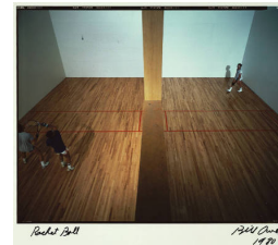
Title: Racketball, from the portfolio Los Angeles Documentary Project Date: 1980 Primary Maker: Bill Owens Medium: Silver dye bleach print