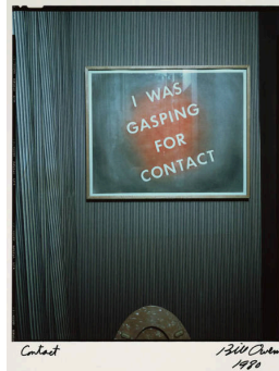
Title: Contact, from the portfolio Los Angeles Documentary Project Date: 1980 Primary Maker: Bill Owens Medium: Silver dye bleach print