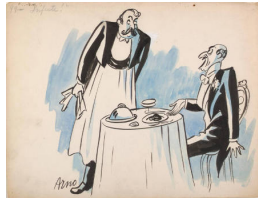
Title: INFECTE! (?) Primary Maker: Peter Arno Medium: ink and wash on paper