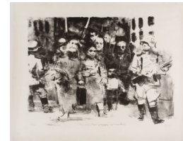
Title: Warsaw Ghetto Primary Maker: Jack Levine Medium: Lithograph on BFK Rives paper Edition 68/120