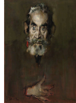
Title: Portrait of Julio de Diego Primary Maker: Jack Levine Medium: Oil on canvas