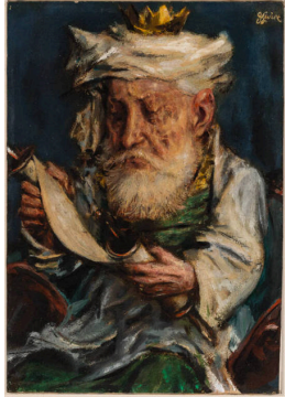
Title: The King Primary Maker: Jack Levine Medium: Oil on hardboard