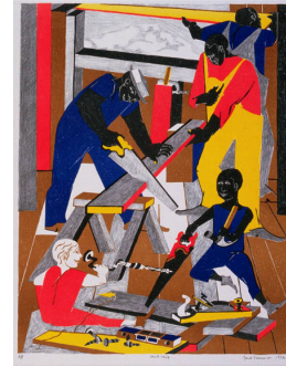
Title: Workshop Date: 1972 Primary Maker: Jacob Lawrence Medium: Color lithograph on wove paper