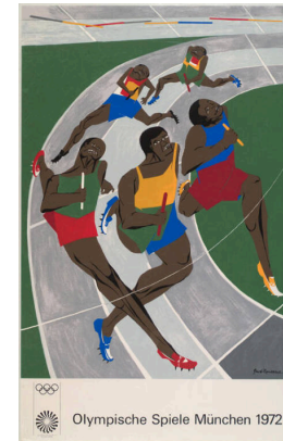
Title: Olympische Spiele München 1972 Date: 1972 Primary Maker: Jacob Lawrence Medium: Color lithograph with screenprint