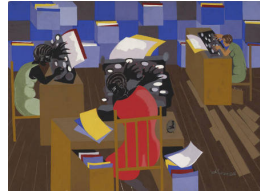
Title: The Typists Date: 1966 Primary Maker: Jacob Lawrence Medium: Gouache and tempera on heavy ivory wove paper