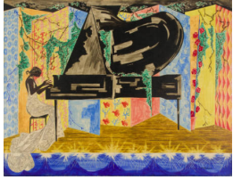
Title: Theatre Series No. 6: Concert Date: 1952 Primary Maker: Jacob Lawrence Medium: Tempera on paper, mounted on hardboard