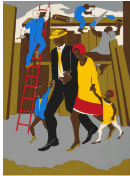
Title: The Builders Date: 1974 Primary Maker: Jacob Lawrence Medium: Color screenprint Edition 71/300