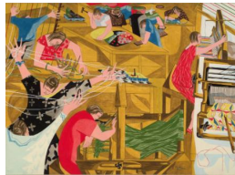
Title: Occupational Therapy No. 2 Date: 1950 Primary Maker: Jacob Lawrence Medium: Gouache