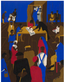
Title: Migrants Arrive and Cast Their Ballots Date: 1974 Primary Maker: Jacob Lawrence Medium: Gouache