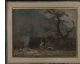
Title: Two Nudes In Landscape Primary Maker: Louis Michel Eilshemius Medium: Oil on board