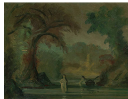
Title: Untitled Landscape Date: 1920 Primary Maker: Louis Michel Eilshemius Medium: Oil on paper mounted on cardboard