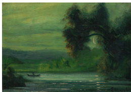
Title: Untitled landscape Date: 1905 Primary Maker: Louis Michel Eilshemius Medium: Oil on paper mounted on cardboard