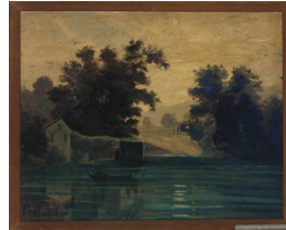
Title: Twilight Landscape Primary Maker: Louis Michel Eilshemius Medium: Oil on canvas mounted on board