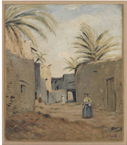
Title: Street in Biskra Date: ca. 1893 Primary Maker: Louis Michel Eilshemius Medium: Oil on hardboard