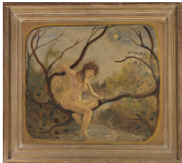
Title: Nude in Tree Date: 1917 Primary Maker: Louis Michel Eilshemius Medium: Oil on composition board