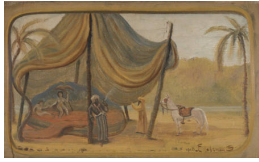
Title: The Sheik Date: 1918 Primary Maker: Louis Michel Eilshemius Medium: Oil on composition board