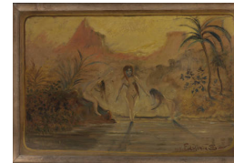
Title: Nymphs at Sunset Date: 1917 Primary Maker: Louis Michel Eilshemius Medium: Oil on board