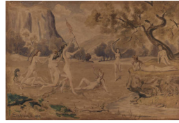
Title: Springtime Song Date: 1902 Primary Maker: Louis Michel Eilshemius Medium: Watercolor and oil on paper, mounted to pressed paperboard