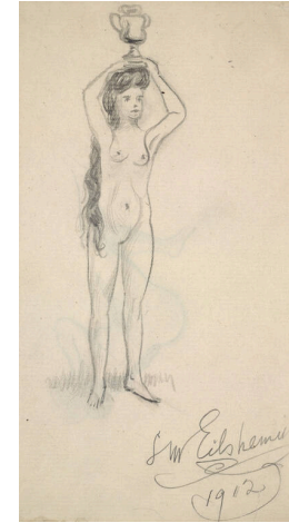
Title: Standing Nude with Chalice Date: 1912 Primary Maker: Louis Michel Eilshemius Medium: Double-sided drawing: pencil on paper