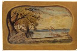
Title: Lake Geneva, Switzerland Date: 1911 Primary Maker: Louis Michel Eilshemius Medium: Oil on board