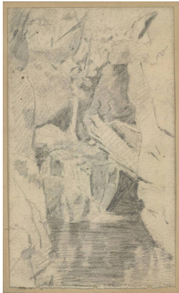
Title: The Flume, Adirondacks Date: 1885 Primary Maker: Louis Michel Eilshemius Medium: Pencil on paper, mounted to another backing