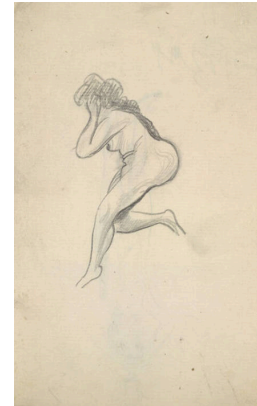
Title: Nude Date: 1912 Primary Maker: Louis Michel Eilshemius Medium: Double-sided drawing: pencil on paper