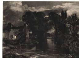
Title: Mill Stream Date: 1831 Primary Maker: David Lucas Medium: Mezzotint on wove paper