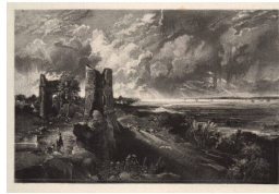
Title: Hadleigh Castle Primary Maker: David Lucas Medium: Mezzotint on Chine-collé