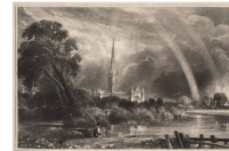
Title: Salisbury Cathedral Primary Maker: David Lucas Medium: Mezzotint on Chine-collé