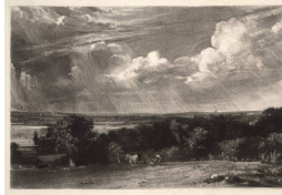
Title: A Summerland Primary Maker: David Lucas Medium: Mezzotint on wove paper