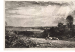
Title: Summer Morning Date: 1831 Primary Maker: David Lucas Medium: Mezzotint on wove paper