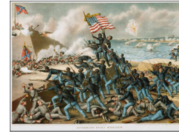
Title: Storming Fort Wagner Date: ca. 1890 Primary Maker: Louis Kurz Medium: Color lithograph on wove paper