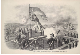
Title: Sargent Jasper Recovers the Flag at Charleston Date: ca. 1863 Primary Maker: Louis Kurz Medium: Black lithograph on wove paper