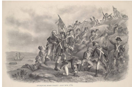
Title: Storming Stony Point Date: ca. 1885 Primary Maker: Louis Kurz Medium: Black lithograph on wove paper