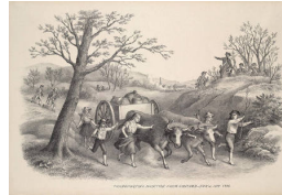
Title: Transporting Munition from Concord Date: ca. 1885 Primary Maker: Louis Kurz Medium: Black lithograph on wove paper