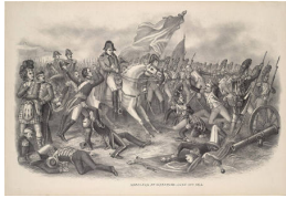
Title: Napoleon at Waterloo Primary Maker: Louis Kurz Medium: Black lithograph on wove paper