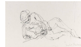
Title: Nude Reading on Bed Date: 1975 Primary Maker: Isabel Bishop Medium: Ink and pencil on white wove paper