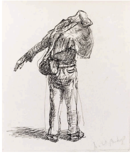
Title: Putting on the Jacket (recto); and sketch of a man wearing a cap and holding his coat (verso) Primary Maker: Isabel Bishop Medium: Double-sided drawing: ink with pencil border (recto); ink (verso)