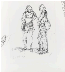
Title: Students Talking [female figure wearing a halter top and a short skirt; male figure carrying a shoulder bag] Primary Maker: Isabel Bishop Medium: Ink and pencil