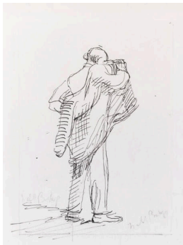
Title: Figure seen from behind, putting proper left arm into a coat (recto); Crouching figure, cut off (verso) Primary Maker: Isabel Bishop Medium: Double-sided drawing: ink and pencil on white wove paper