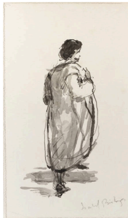
Title: The Full Coat Primary Maker: Isabel Bishop Medium: Ink, wash, and pencil on cream wove paper