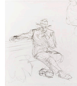
Title: Seated figure wearing hat, proper right arm outstretched on back of bench Primary Maker: Isabel Bishop Medium: Ink and pencil on white wove paper