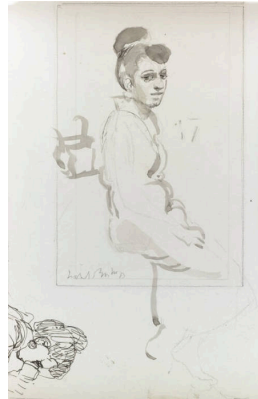
Title: Seated woman, facing proper right (recto); Standing woman (verso) Primary Maker: Isabel Bishop Medium: Double-sided drawing: ink, wash, and pencil on cream wove paper