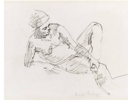
Title: Reclined nude figure, proper left hand holding proper left foot Primary Maker: Isabel Bishop Medium: Ink and pencil on cream wove paper