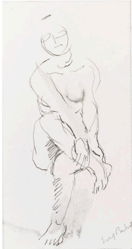
Title: Seated nude figure, proper right leg crossed over left (recto); Sketch of a nude woman (verso) Primary Maker: Isabel Bishop Medium: Ink, pencil, and wash on white wove paper