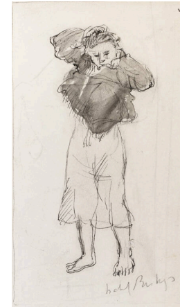
Title: Figure, putting on sweater Primary Maker: Isabel Bishop Medium: Ink, wash, and pencil on cream wove paper