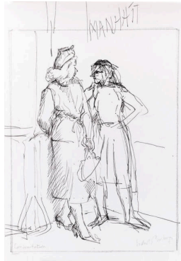
Title: Confrontation (recto); Woman wearing a hat with a purse and holding a book (?) in her hands (verso) Primary Maker: Isabel Bishop Medium: Double-sided drawing: ink and pencil on white wove paper