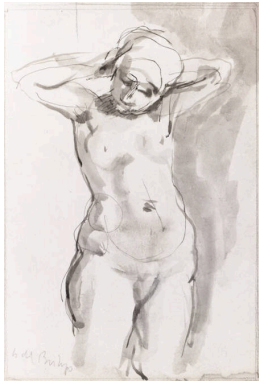
Title: After the Bath Date: ca. 1940s (1946?) Primary Maker: Isabel Bishop Medium: Ink and wash with pencil border