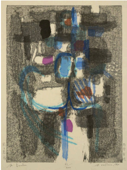
Title: An Emotion Date: 1960 Primary Maker: Ansei Uchima Medium: Color woodcut on Japanese paper Edition 52/200