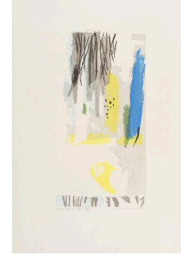
Title: Early Spring, from the portfolio Eleven Prints by Eleven Printmakers Date: 1961 Primary Maker: Ansei Uchima Medium: Color woodcut Edition 49/100