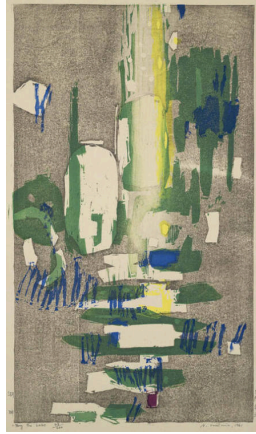
Title: By the Lake Date: 1961 Primary Maker: Ansei Uchima Medium: Color woodcut on Japanese paper Edition 63/200